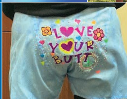
Cleverly decorated boxers represent a meaningful message.

The CoxHealth Foundation is committed to providing free colonoscopies to patients who need, but cannot afford this vital, life-saving prevention screening. The RUNDIE and an annual Gala provide a majority of the funding to cover the screening cost. The "CRAP" Gala has been canceled for the last two years due to COVID-19, causing the Colo-Rectal Cancer Awareness Program to face a rapid decline in funds. The Foundation is grateful to everyone who stepped up and ran the RUNDIE this year, helping us keep the mission of the program going. If you would like to support the fight against colon and rectal cancers, your donation is greatly appreciated. We will gladly send donors a pair of undies as well as a reminder that Underwear Saves Lives.